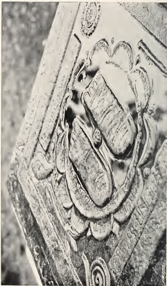
THE FOOTPRINTS OF VISHNU.